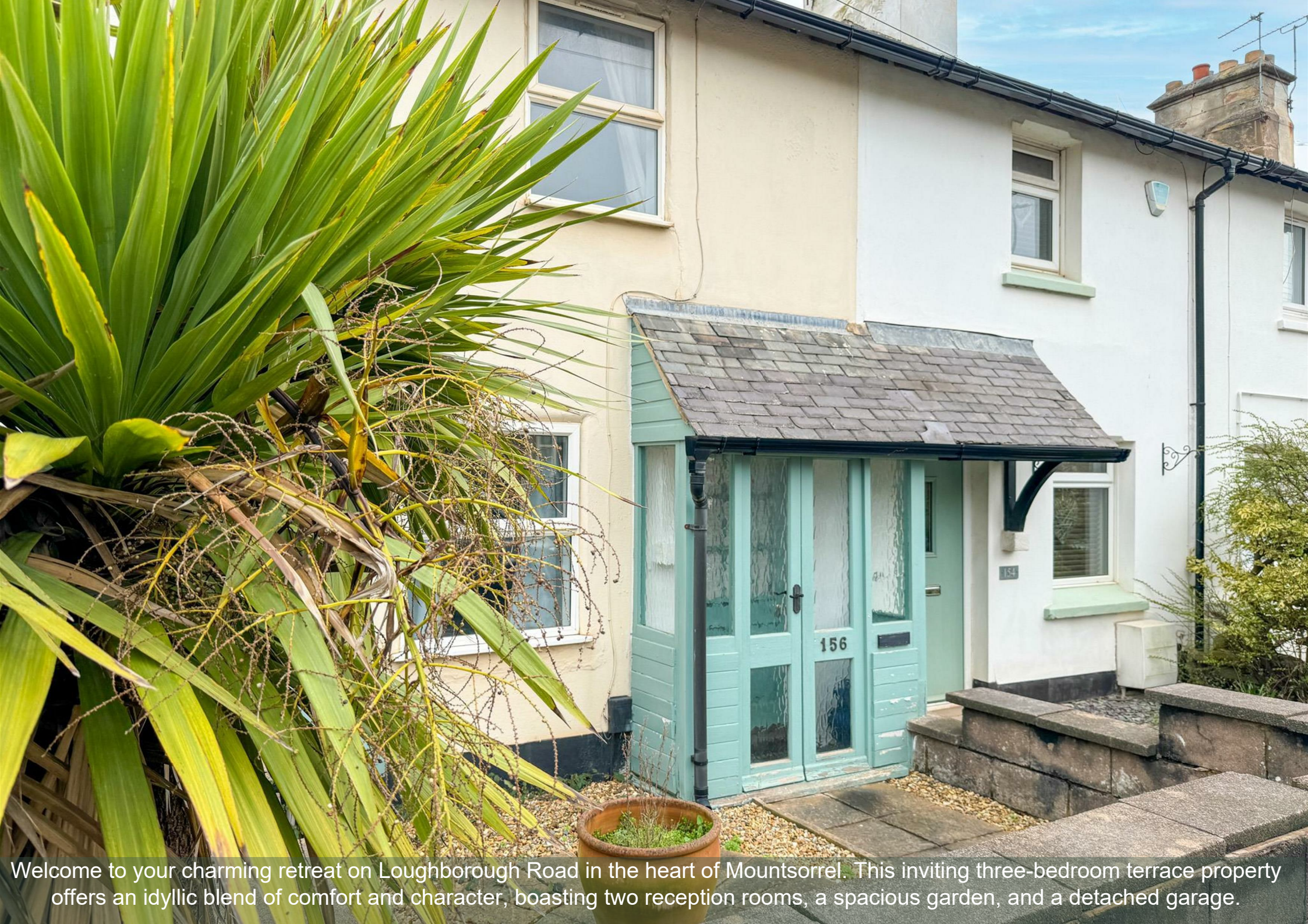
Welcome to your charming retreat on Loughborough Road in the heart of Mountsorrel. This inviting three-bedroom terrace property offers an idyllic blend of comfort and character, boasting two reception rooms, a spacious garden, and a detached garage.